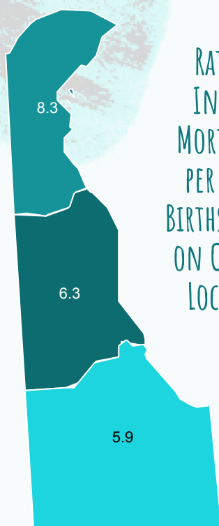
RATE OF INFANT MORTALITY, PER 1,000 BIRTHS, BASED ON COUNTY LOCATION

There was approximately 34 percent decline in IMR from a high of 9 per 1,000 live births in 2015 to 6.6 in 2018.